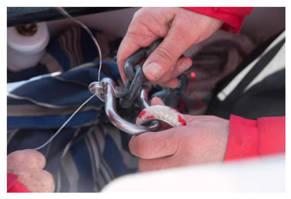
All shackles should be moused